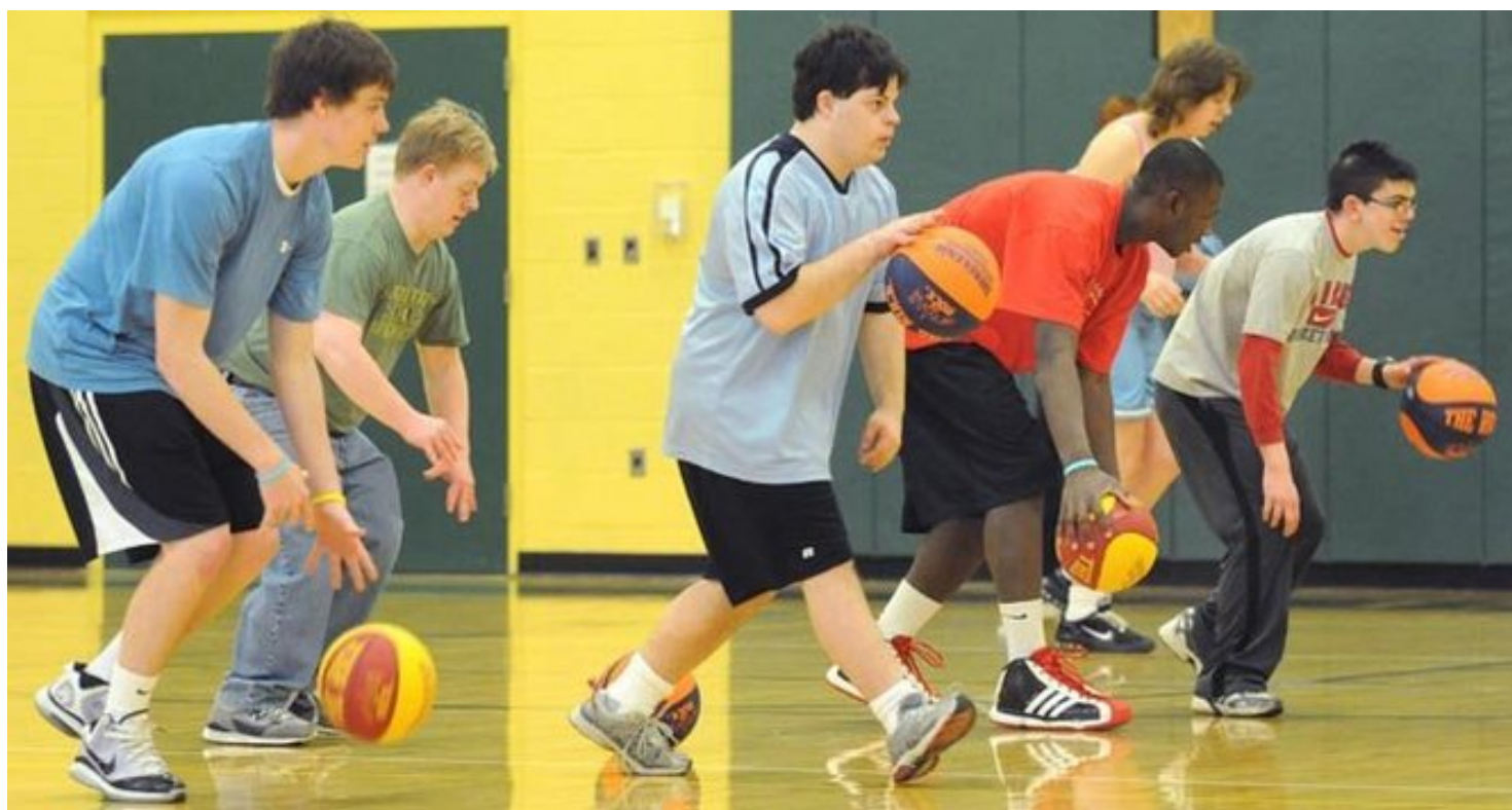
Participants in the Via All-Star Basketball Clinic, an event for kids with special needs, work on moving the ball across the court.